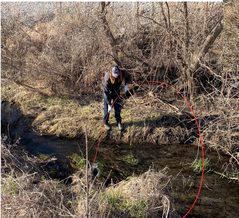
Left: Conservation Agronomist, Will Hoffmann, uses a Tile Maverick to accurately locate drainage tile lines. The cable is energized and is located using a utility locator wand.